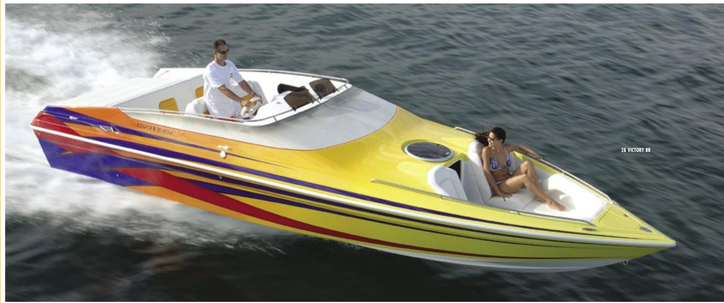
28 VICTORY BR