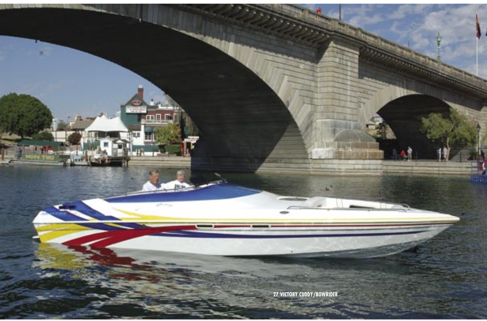
27 VICTORY CUDDY/BOWRIDER